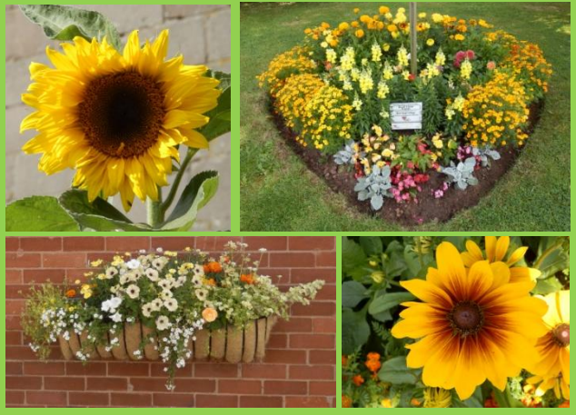
To help in the campaigns please contact any member of the Parish Council

As the season progresses, gold plants are popping up in many places, including in private gardens, in the Sunday School's pots by the church porch (with very tall sunflowers!), in beds and borders and at the Village Hall. The village has glowed with gold in this year's long spell of sunshine. Thanks to all who embraced the RHS's theme for 2014 with such enthusiasm.